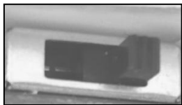
Left=Slowest / Right=Fastest

Your board has 2 adjustable speed ranges: High & Low . A slide switch located in the battery compartment of remote control gun controls the speed range. To adjust the speed capacity, turn off the wireless remote and remove the battery cover from the base of remote control handle. Locate the slide switch inside the compartment. Set the switch to the desired speed range: left = slowest; right=fastest speed range. (See picture below, left.) With slide switch set, you can turn on the board, then the remote.